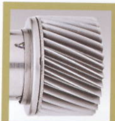
Cenex Auto Gold ™ Multi-Vehicle Synthetic Blend ATF